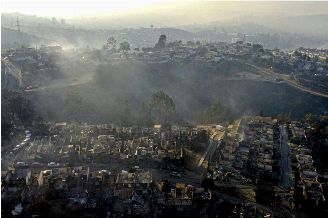
The scale of the devastation

disaster: as of midday on Saturday, a total of 92 fires were active, strong winds fanned the flames and a blanket of black smoke covered the streets.