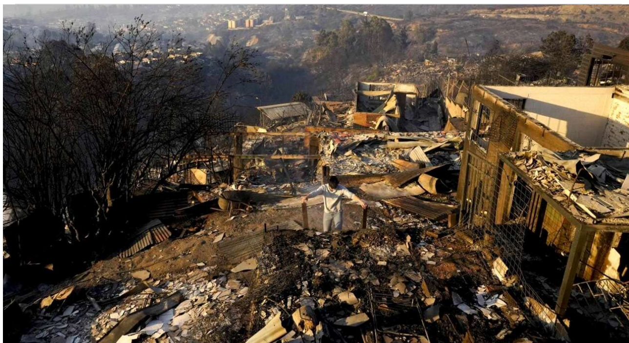
The fires in Chile, photo Lapresse

T he death toll from the fires that are affecting central Chile and in particular the Valparaiso region has risen to 51. Local authorities speak of an unprecedented