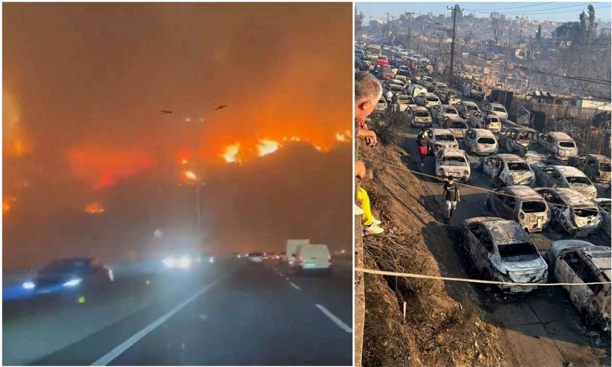
The situation in Valparaiso

Chilean President Gabriel Boric warns his compatriots: "Given the conditions of the tragedy, the number of victims will certainly increase in the coming hours."