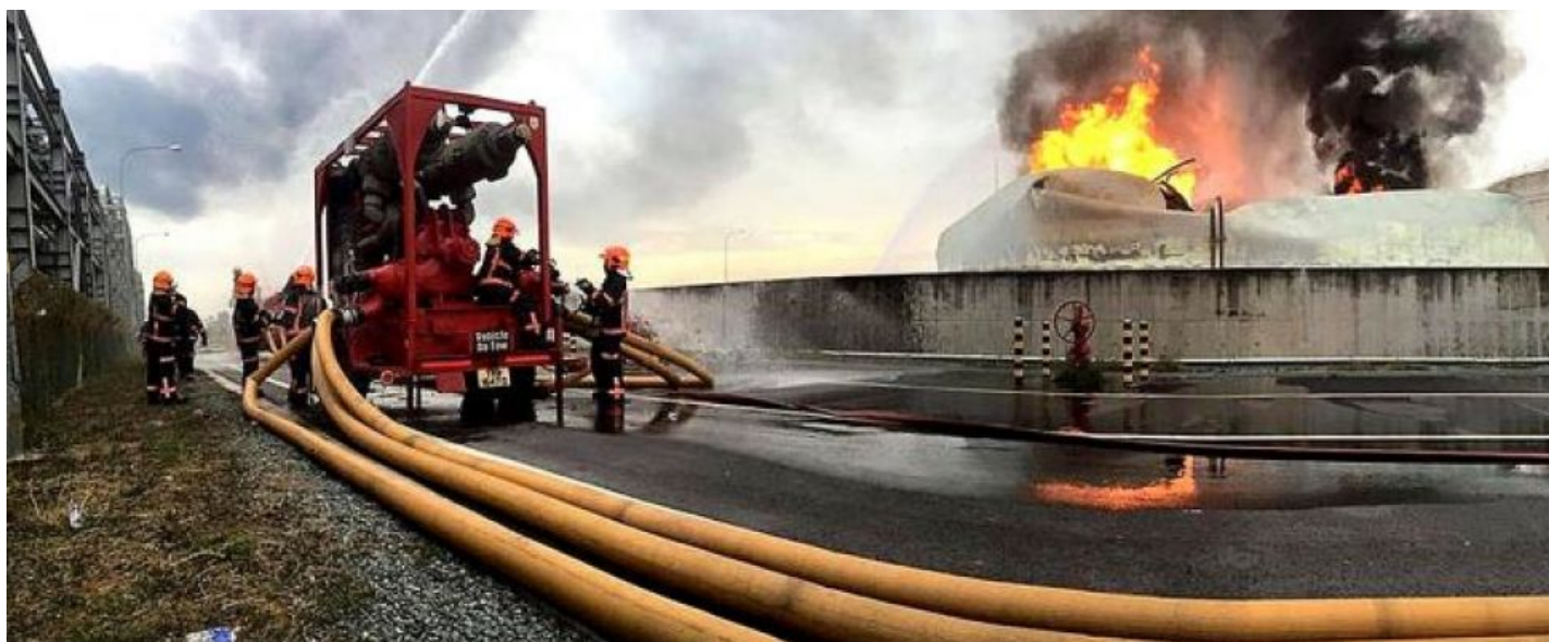
FIERY: (Above) SCDF fighting the fire. The plume of black smoke could be seen from about 2km away.

Più di un tablet. Meglio di un telefono http://store.hp.com/