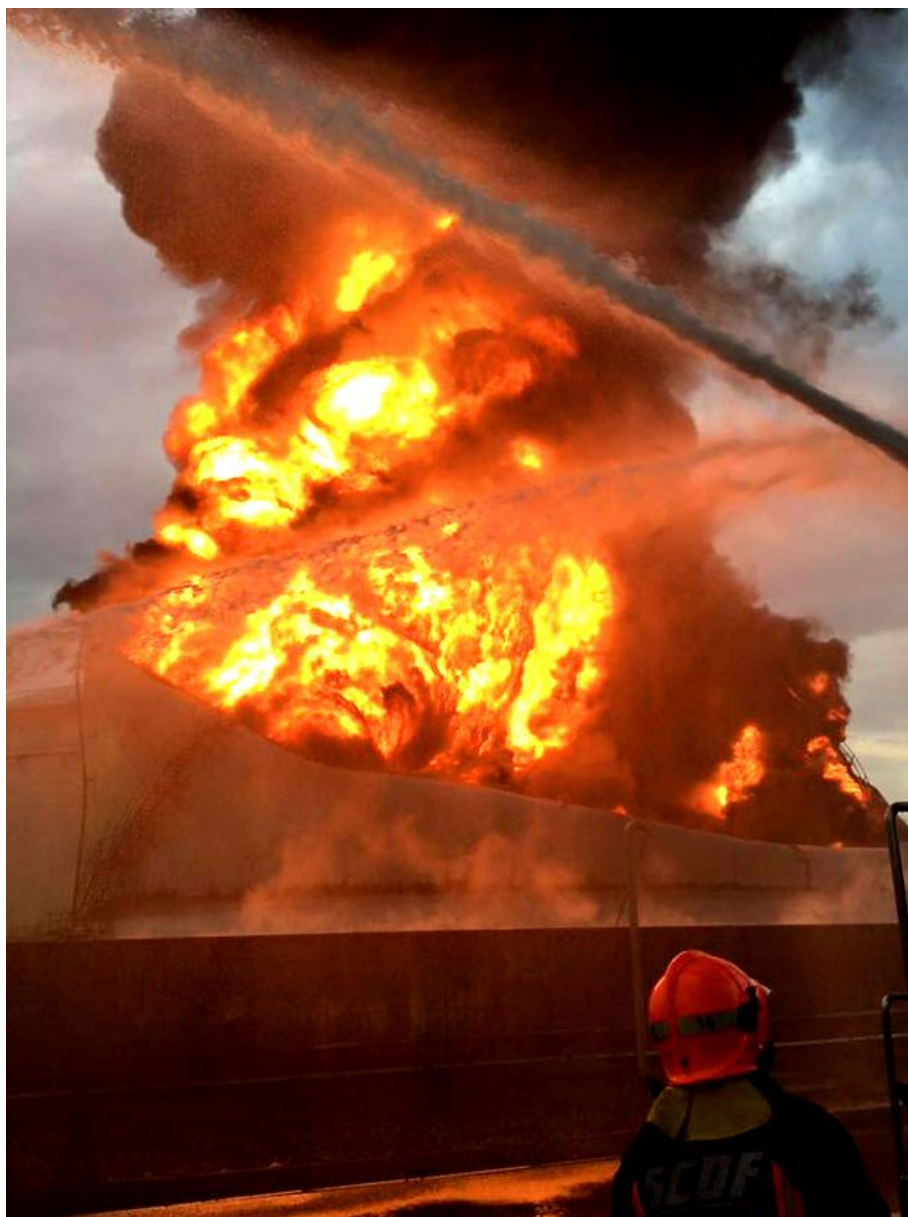
FIERY: (Above) SCDF fighting the fire.

The tank measured about 40m in diameter and 20m in height.