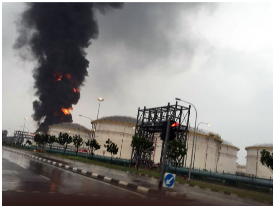
FIERY: The plume of black smoke (above) could be seen from about 2km away.

He said there was "a lot of black smoke", although the fire looked quite small from his office, which is about 300m from the site.