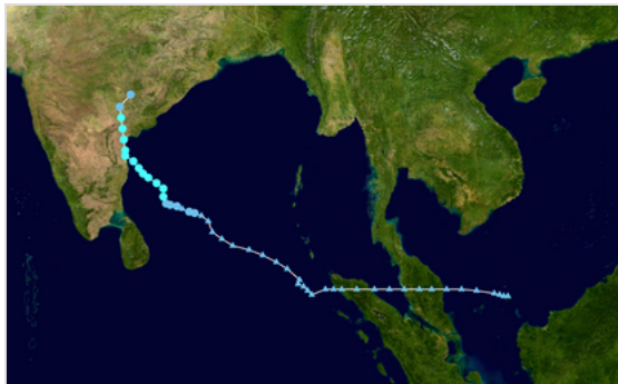
Map plotting the storm's track and intensity, according to the Saffir–Simpson scale