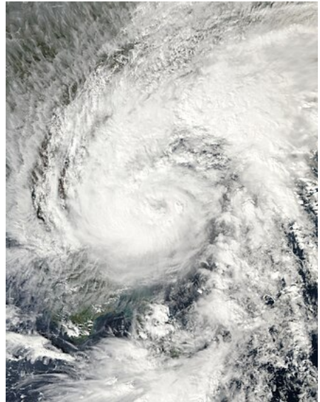
Cyclone Michaung near peak intensity on 4 December